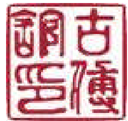
Chop or seal of the Kodenkan