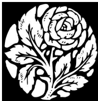
Mon of the Okazaki Family, Kodenkan and Chico Kodenkan