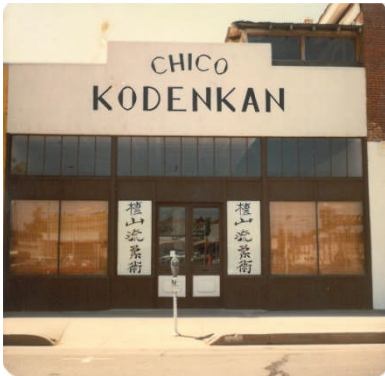
810 Broadway, Chico CA